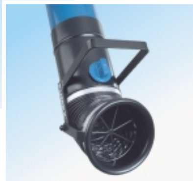
Suction nozzle with 360° swivel

Fumex also offers a range of fans, accessories, automatic control devices and filters for our local extractors.